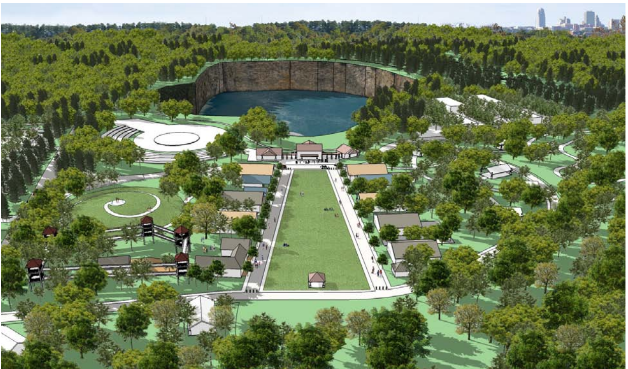
THE QUARRY VILLAGE